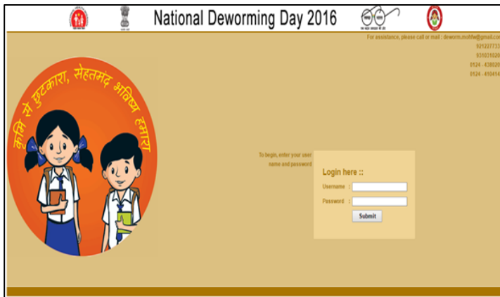
Screenshot of NDD web-based app when you click on the above address