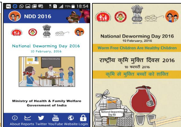
Screenshot of NDD mobile app access when you download the app